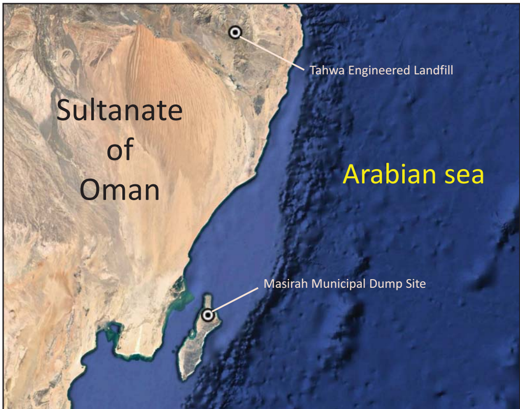
Figure 1. Map showing location of Masirah municipal dump site, which was ‘closed’ June 2018. Since then, most waste that might be consumed by vultures has been gathered at a nearby transfer station and trucked to Tahwa, the site of the modern engineered landfill some 200 km to the north on the mainland.

We counted and aged all Egyptian Vultures scavenging at the dump site every month during January 2013–March 2018, except August and November 2014. Vultures were